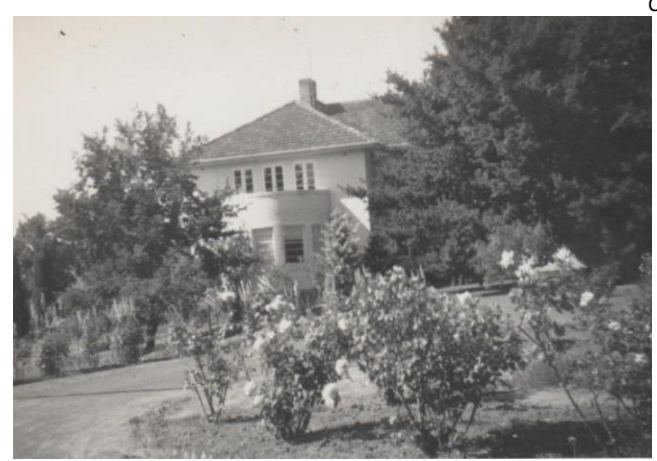
Howard (Senior) House and the Rose Garden